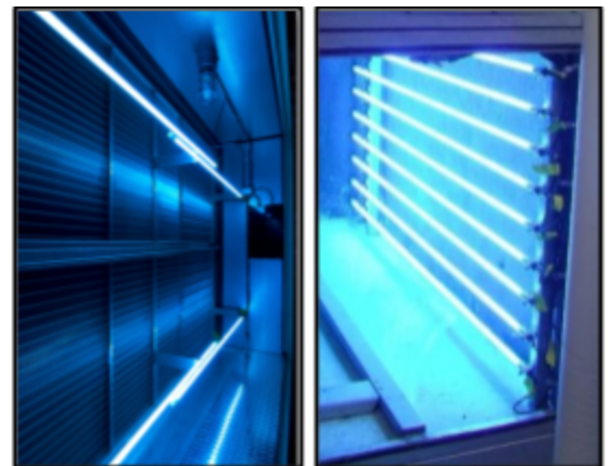
Coil Irradiation (lamps spaced at 36" centers)

UV-C's ability to decontaminate the air flowing through a building's HVAC system can be most beneficial where communicable diseases are more common, such as office buildings, schools, healthcare settings, municipal offices, etc. An improperly maintained HVAC system in these environments can promote disease transmission as it recirculates those same germs throughout the building. Conversely, installing UV lamps, with their ability to destroy airborne viruses, bacteria and mold spores, can prevent disease transmission and/or cross-contamination.