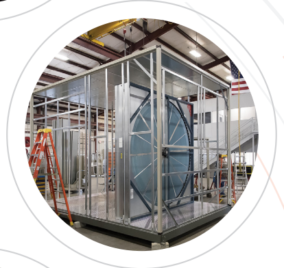
AHRI Certified® enthalpy wheels