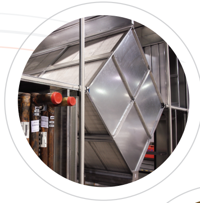
AHRI Certified® flat plates